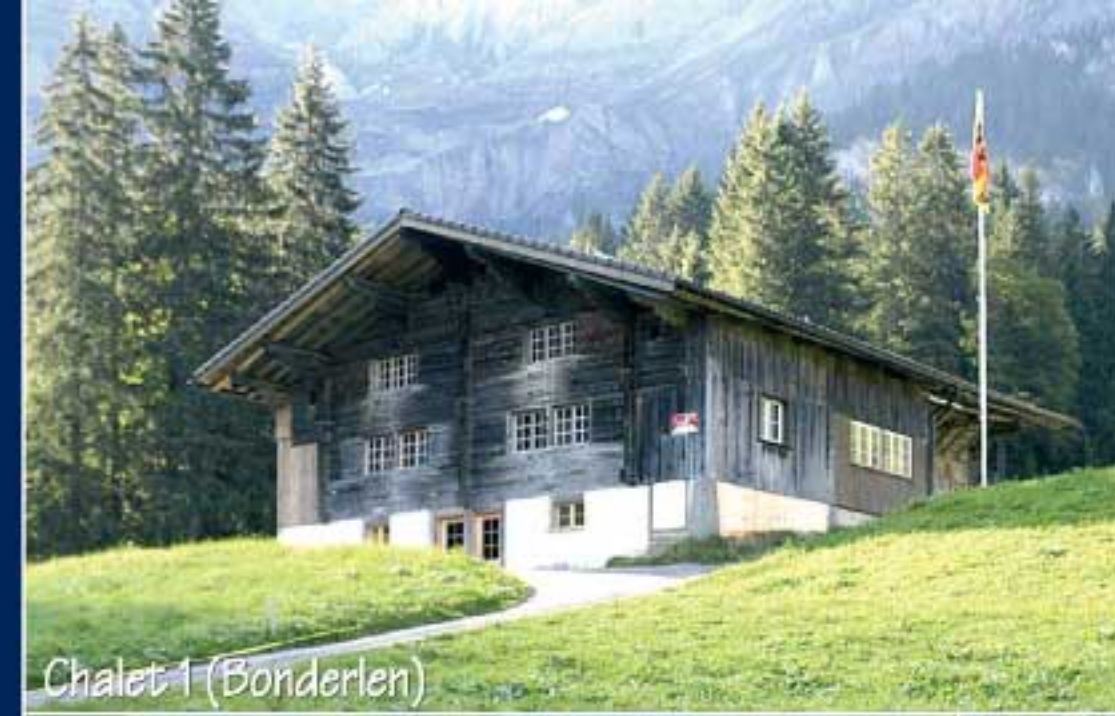
Chalet 1 (Bonderlen)