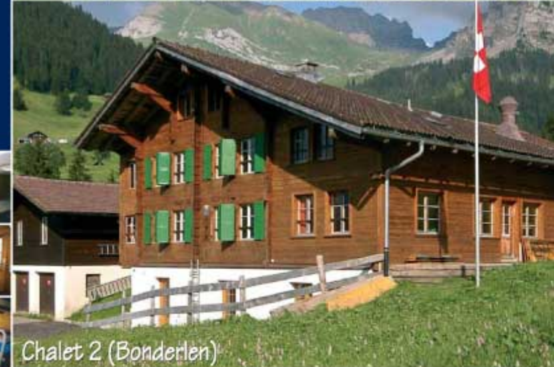
Chalet 2 (Bonderlen)