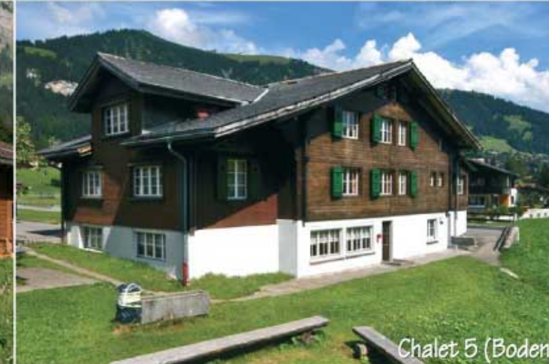
Chalet 5 (Boden)