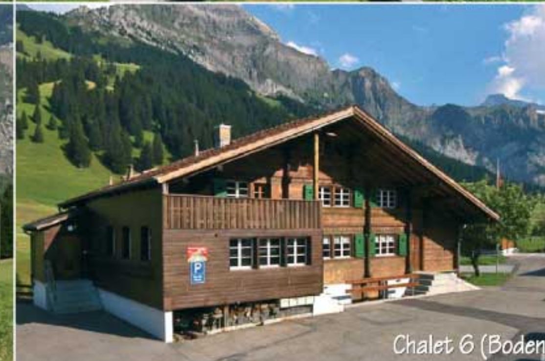
Chalet 6 (Boden)