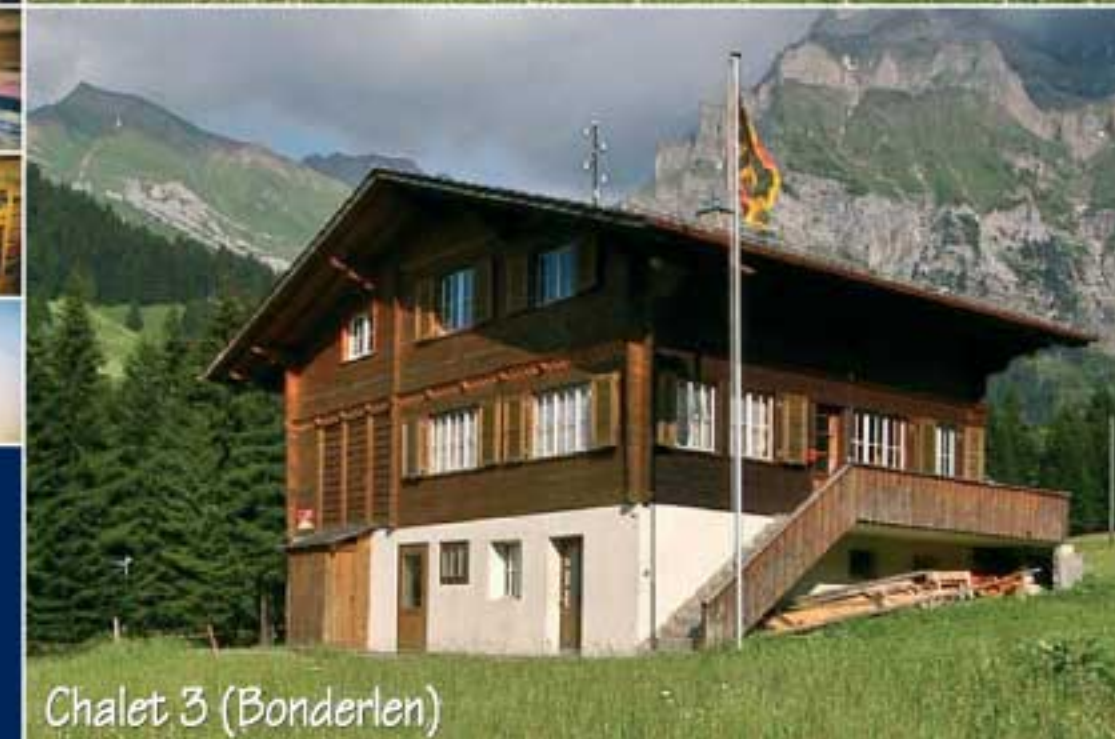
Chalet 3 (Bonderlen)