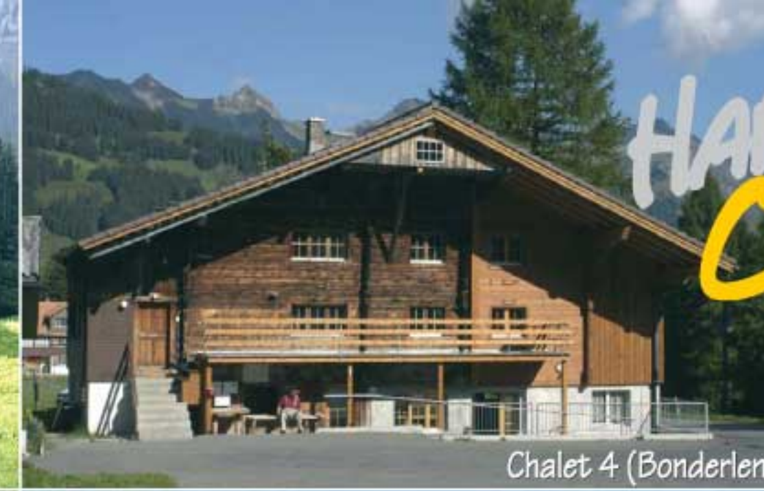
Chalet 4 (Bonderlen)